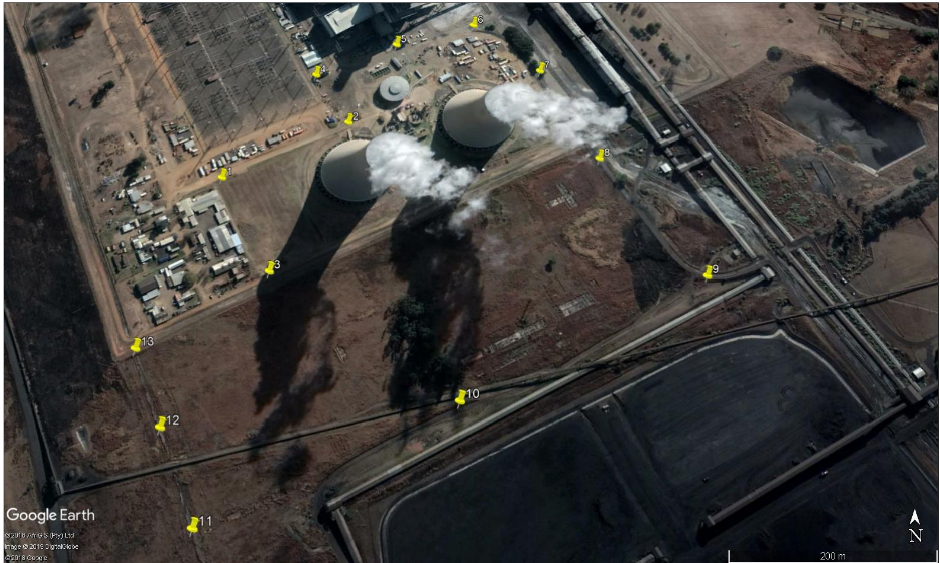
Figure 2: Site Coordinates for the proposed development footprint on the Southern Cooling Towers at the KPS.